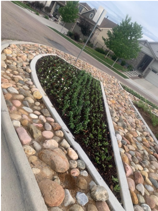
Item 13 Same as above.