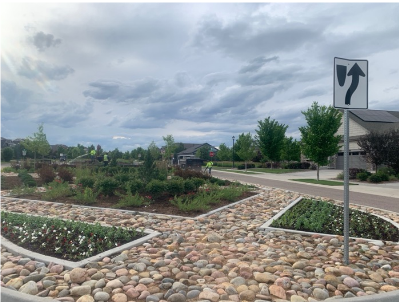
Item 14 Same as above.